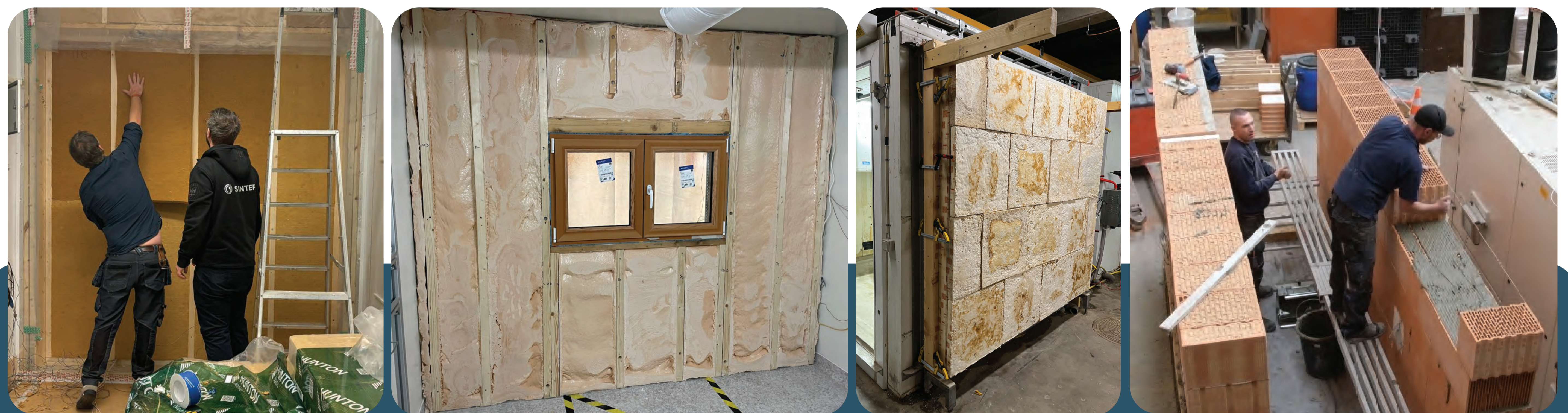
Demonstration of applicability of material associations in experimental facilities, and analysis of buildability of solutions.