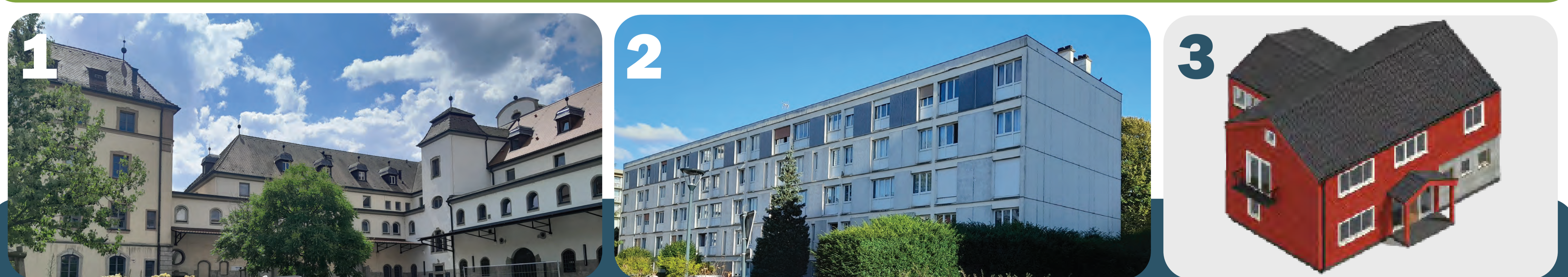
Numerical modeling of whole building retrofit with EasiZero solutions: 1) historical building (DE), 2) multi-family dwellings (FR), 3) detached house (NO)